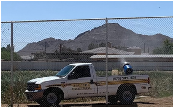
Workers from Sunland Park Vector control are shown treating the pond 5/23/24.

Your HOA board is working to resolve the problem of mosquitoes. We have acquired some Gambusia (mosquito fish) from New Mexico Vector Control to mitigate larvae in the pond. We have also called El Paso Vector Control to spray our neighborhood and Sunland Park Vector Control to spray the pond.